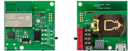
Evaluation board (Front and back)

(*1 : To access the web site, need registration with serial code of EVK)